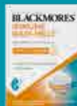
Blackmores Immune Rapi-Melt 60 Tablets