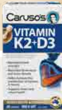
Caruso's Vitamin K2 + D3 60 Capsules