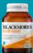
Blackmores Lyp-Sine 100 Tablets