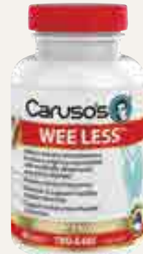
Caruso's Wee Less 60 Tablets