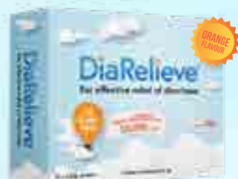
DiaRelieve Diarrhoea Relief 3.25g 10pk

Always read the label and follow the directions for use. Incorrect use could be harmful.