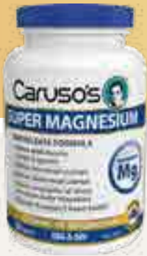
Caruso's Super Magnesium 120 Tablets