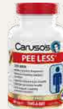
Caruso's Pee Less 60 Tablets