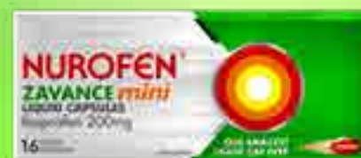
Nurofen Zavance Mini 16 Liquid Capsules