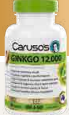
Caruso's Ginkgo 12,000 60 Tablets