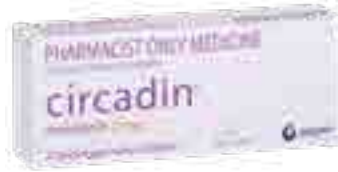
Circadin Melatonin 2mg 30 Tablets#^