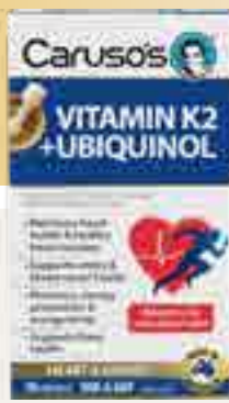
Caruso's Vitamin K2 + Ubiquinol 30 Capsules