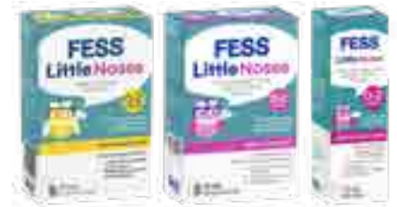
FESS Little Noses Saline Drops and Sprays Selected Range