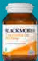
Blackmores Cod Liver Oil 1000mg 80 Capsules