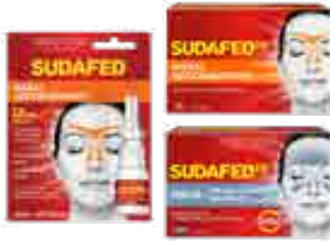
Sudafed Nasal Decongestant or PE Sinus Relief Selected Range#