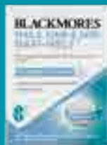
Blackmores Nails, Hair & Skin Rapi-Melt 60 Tablets