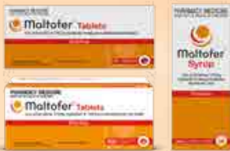
Maltofer 100mg 30 or 100 Tablets or Syrup 150mL#

Always read the label and follow the directions for use.