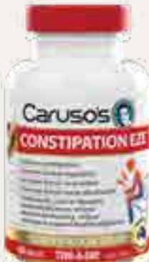
Caruso's Constipation EZE 60 Tablets