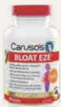
Caruso's Bloat EZE 60 Capsules