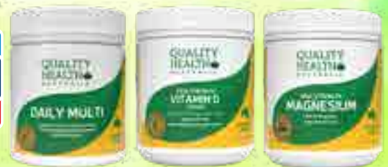
Quality Health Vitamins Selected Range