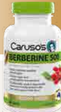
Caruso's Berberine 500 60 Tablets