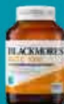
Blackmores Bio C 1000 150 Tablets