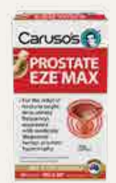
Caruso's Prostate EZE MAX 60 Capsules