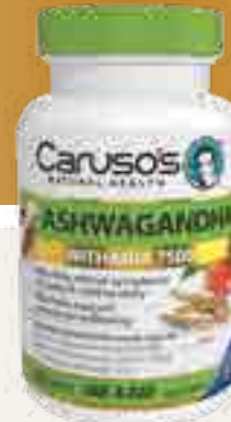
Caruso's Ashwagandha 50 Tablets