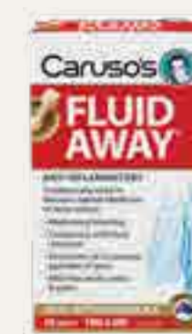
Caruso's Fluid Away 60 Tablets