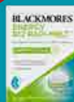
Blackmores Energy B12 Rapi-Melt 1000mcg 60 Tablets